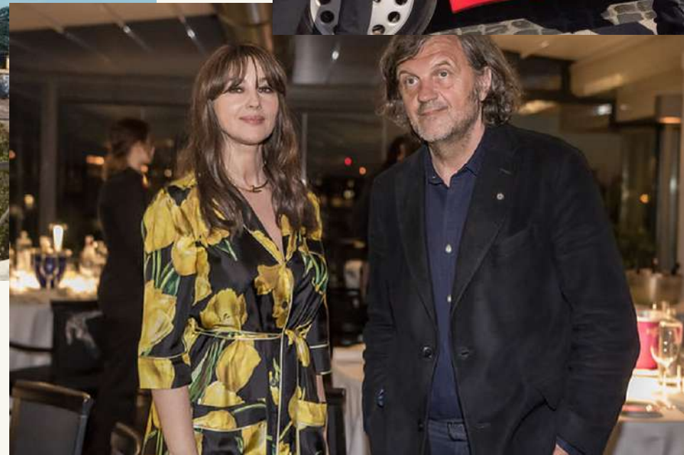
Monica Bellucci with Emir Kusturica